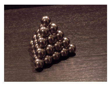
Figure B.1: A triangular pyramid of spheres, corresponding to the second sample input. One edge of the pyramid contains 5 spheres, so the entire pyramid consists of 35 spheres.

shapes: the triangular pyramid (for having very sharp corners) and the sphere (for having no corners at all). The idea is to create a large regular tetrahedron out of many small spheres, similar to the one shown in Figure B.1.